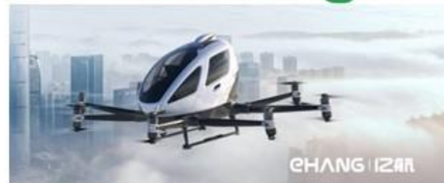
Pictured: An image of a pilotless passenger drone.

Chinese companies are paving the way for people to be transported from city to city in pilotless passenger drones! A transportation company, called EHang, has asked the government to approve a commercial licence for them to start operating around the city of Guangzhou. It's the capital and largest city of Guangdong province (in southern China) and could soon see the drones being booked like taxis. EHang plans for their two-seater, EH216-S, to fly along a pre-programmed route with no pilot. The battery-powered craft can stay airborne for up to about 25