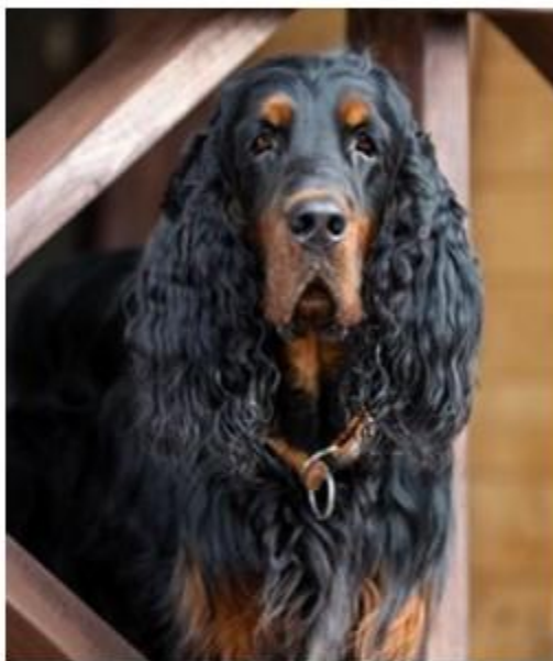
Pictured: A beautiful Gordon Setter, the same breed as Sharwood.