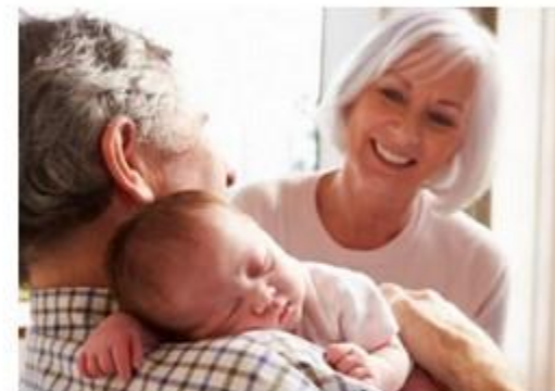
Pictured: Grandparents looking after their new grandchild.

spending time with my granddaughter, and now I can help her parents too!' This new rule is helping grandparents make memories with their grandchildren and giving parents a little extra help. Do you think this is a good idea?