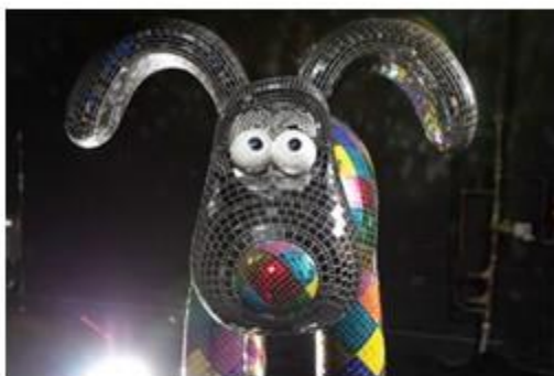
Pictured: Two of the sculptures from the Gromit Unleashed 3 trail.

A new Wallace and Gromit sculpture-spotting trail has been announced! Gromit Unleashed 3 will run throughout July and August 2025 in Bristol, UK, to raise money for Bristol Children's Hospital. The sculpture trail will take participants on a journey through the movies, with sculptures inspired by famous films, and the stories they are based on. Since the first trial ten years ago, over £20 million has been raised for The Grand Appeal, the official Bristol Children's Hospital charity. There isn't a sculpture trail every year, but over four trails, hundreds of Aardman characters - Wallace, Gromit, Feathers McGraw, and now new character, Norbot - have been put on