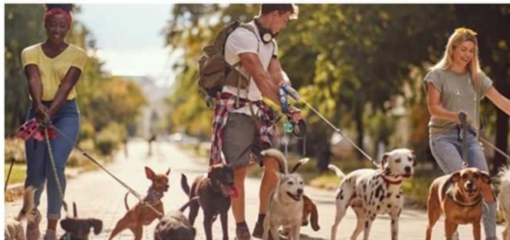
Pictured: A Dog Walk.

Researchers from Max Planck Institute for Psycholinguistics in the Netherlands and the University of Rome have been looking into why dogs might wag their tails. The four scientists have recently published their results and some of them might surprise you! Most people think that dogs wag their tails when they are happy or excited, but this may, in some cases, show nervousness or submission. The scientists said they found that dogs wag their tails much more than other animals that are closely related to them, for example, wolves. Canines in the wild use their tails to improve their balance and to swat away insects. These experts looked at the existing research on tail-wagging and concluded that there may be two reasons why dogs wag their tails so much. The