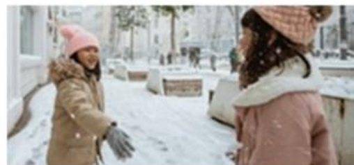
Pictured: Playing in the snow.