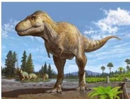
Pictured: An image of Tyrannosaurus mcraeensis released by the New Mexico Museum of Natural History and Science.

A new giant dinosaur species, called Tyrannosaurus mcraeensis , has been discovered in New Mexico, USA. Palaeontologists made the announcement after examining parts of the animal's fossilised skull that had been found at the Hall Lake Formation, a geological formation in Sierra County. The skull is currently on display at the New Mexico Museum of Natural History & Science (NMMNHS). 'Once again, the extent and scientific importance of New Mexico's dinosaur fossils becomes clear – many new dinosaurs remain to be discovered in the state, both in the rocks and in museum drawers!' said Dr. Spencer Lucas, Paleontology Curator at NMMNHS. The massive carnivore, thought to have lived approximately five million years before the Tyrannosaurus rex (T. rex), is thought to be its closest relative! The huge theropods that lived between 71 and 73 million years ago, would have been similar in size to their relative the T. rex – 12m long, up to 4m high and weighing around 8.8 tonnes. Like the T. rex, their humongous skulls