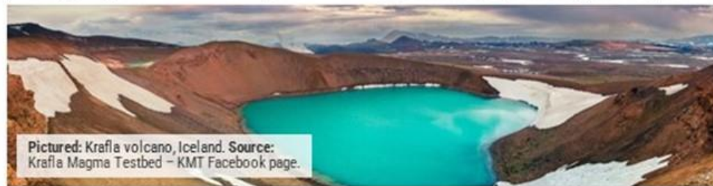
Pictured: Krafla volcano, Iceland.

It's all about location - magma is molten rock that is trapped underground, it becomes lava when it erupts to the surface and keeps flowing like a liquid!