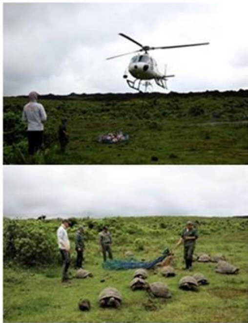
Pictured: Galápagos tortoises being airlifted and released on the island.

136 Giant Galápagos Tortoises have been returned to their natural habitat by conservationists. The Galápagos National Park Directorate, working with the Galápagos Conservancy, successfully transported the young tortoises by helicopter! Flying was determined to be the safest and least impactful way to transfer the endangered animals. The other option being multiple expeditions, involving a journey by sea followed by each tortoise being carried on a person's shoulders for several kilometres over lava fields and challenging terrain. The reptiles, which are all between 5 and 9 years old, were airlifted from Arnaldo Tupiza Chamaidan Breeding and Rearing Centre to the Cinco Cerros area on Isabela Island's Cerro Azul volcano. They have been hatched and brought up at the centre by park rangers, who have ensured they are healthy, microchipped for identification and prepared for release. These most famous residents of the Galápagos Islands, in the Pacific Ocean, are herbivores (meaning they mainly eat plants) and their reintroduction to their native habitat will help maintain ecosystem stability. Dr Jorge Carrión, the Director of Conservation at the Galapagos Conservancy, described their repatriation as, 'a crucial milestone in