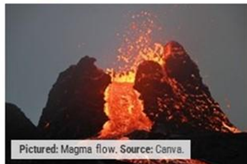
Pictured: Magma flow.

The Krafla Magma Testbed (KMT), in a remote area of Iceland, has been announced as the world's first magma observatory. KMT's website said the research facility, open to all, will have access to a magma chamber (an underground reservoir of molten rock). Scientists plan to drill down to the magma chamber, so that they can observe and experiment on the magma to see how it behaves and reacts whilst underground. This will give them a greater understanding of magma, volcanoes and help to improve volcano prediction. The world's first tunnel to a magma chamber also has the potential to unleash unlimited energy, using geothermal power. Geothermal energy is the heat produced deep in the Earth's core. It is a clean, renewable resource that can be used for heat and electricity. Two boreholes will be drilled, one will give scientists their first direct measurements of magma and the second could help to supercharge geothermal power, giving access to tons of green