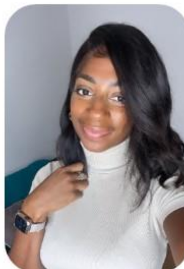
Pictured: Kadeena Cox OBE.

"I decided, MS isn't going to define me. My life doesn't revolve around MS, MS revolves around me. Running, you see, has been my big thing for years. I don't know what I would have done otherwise. I am sure that I would not have recovered anywhere near as well if I had not had this to strive for. It has helped me massively from a physical perspective, and it has also enabled me to control certain parts of my condition. I would have been a lost girl without my sport."