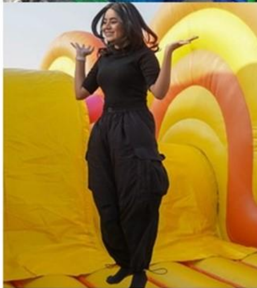
Pictured: Jumbo Jump in Karachi, Pakistan.

Have you ever bounced or played on a bouncy castle?