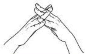
The letter W.