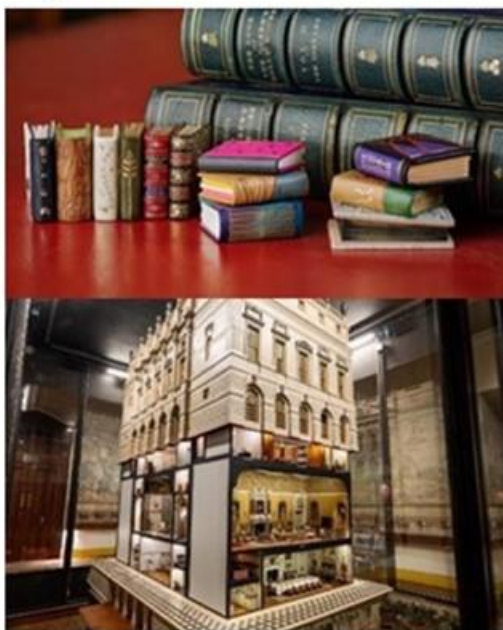
Pictured: Books from the new miniature book collection and Queen Mary's Doll's House.

Queen Mary's Doll's House is 100 years old this year! To celebrate, its library has been updated with a collection of miniature books written by some of today's most famous authors. The initiative, led by Queen Camilla, has created a modern-day miniature book collection within the doll house's library. Twenty authors, including Sir Tom Stoppard, Dame Jacqueline Wilson, Sir Ben Okri, Bernardine Evaristo and Julia Donaldson, contributed to the project by each producing a 4.5cm high mini handwritten book to add to the library. The Queen has even penned one herself! The books are on display, alongside the scaled-down replica of an Edwardian-style royal residence, at Windsor Castle throughout 2024. The doll house that was gifted to Queen Mary has electricity, running water and even working lifts. All the books in the original miniature library, around 175, are real books, handwritten by leading authors of the 1920s such as A.A. Milne, Sir Arthur Conan-Doyle and Vita Sackville-West. The Queen called the library, 'the most breath-taking space in the house', adding, 'These new books highlight the incredible richness of twenty-first