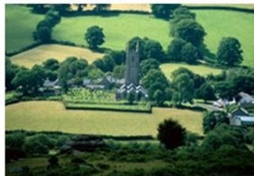
Pictured: A view over fields in Widescombe in the Moor, England.

hedges contain many different kinds of plants. Hedges also provide a home for many species of wildlife and aid in the fight against climate change. Furthermore, they can reduce air pollution and even improve soil quality! Do you know any other benefits of growing more hedges? Alternatively, can you think of any drawbacks?