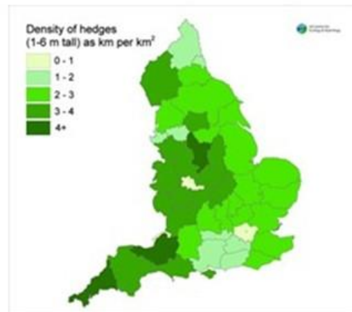
Pictured: Map of England showing hedgerow densities by area.

A new map has revealed that there are enough hedges in England to reach around the world ten times! The hedgerow map was created using low-flying aircraft that scanned the ground with sensors that emitted pulses of light to create 3D images, providing precise information on the quantity, length, and height of hedges below. The whole of England was scanned between 2016 and 2021 to produce the map. Scientists at the UK Centre for Ecology and Hydrology (UKCEH) announced that there was a total of 390,000km of fully grown field hedges in England. The information gathered has been used to provide the first accurate map of the hedgerow network across the country. The highest density of hedges are found in Cornwall, Somerset, and Derbyshire. Dr Richard Broughton, leader of the project said, 'The new map enables us to see where hedgerows are sparse and identify sites for targeted planting and restoration efforts, linking up habitats and improving the hedgerow network. It can also be used to estimate the potential amount of carbon that hedgerows could remove from the atmosphere and store.' Researchers believe that the map will help focus efforts to restore the country's hedges - it is estimated that there were twice as many in the 1940's. They say this is important to increase biodiversity, as