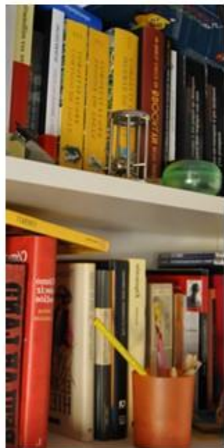
Pictured: A typical bookshelf.