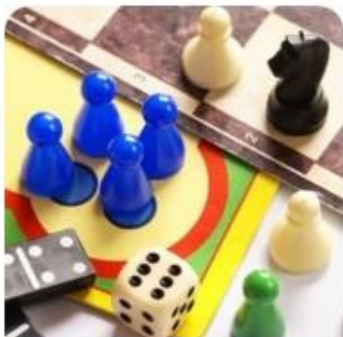
Instructions for games