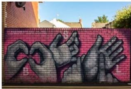
Pictured: British Sign Language on Elm St Graffiti Alley, Roath, Cardiff.