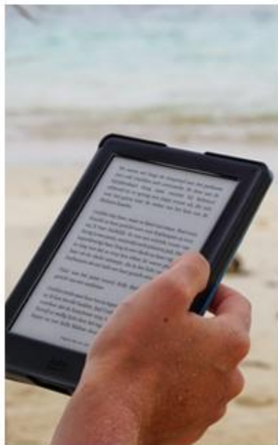
Pictured: An e-reader.

You can also use an app on tablets or mobile phones as an e-reader.