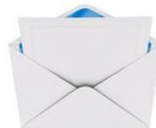
Letter, card or invitation