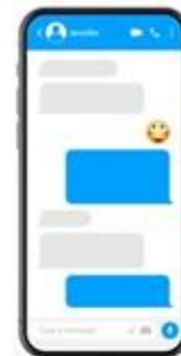
Messages from friends