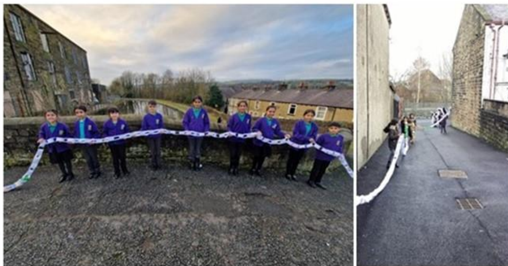
Pictured left: Pupils from Lomeshaye Junior School holding their peace chain. Pictured right: Pupils from Whitefield Infant School carrying their peace chain.