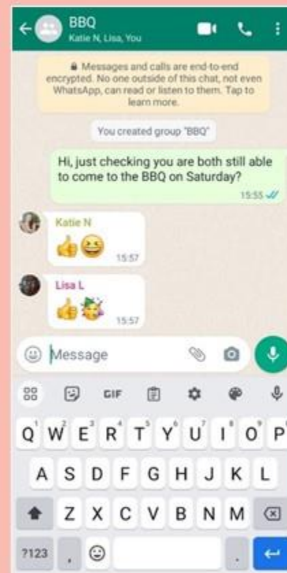
A WhatsApp message between friends, who are planning to meet for a BBQ.

What emojis have been used in the Picture News post and the WhatsApp message? Why have they been used?