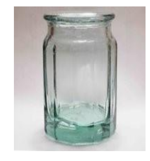
Smooth Hard Stiff Transparent