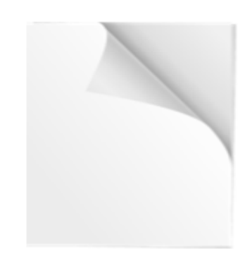
Soft Smooth Opaque Flexible