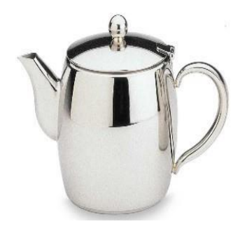
Hard Stiff Opaque Shiny