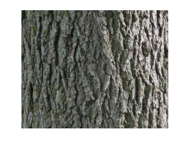
Hard Rough Opaque